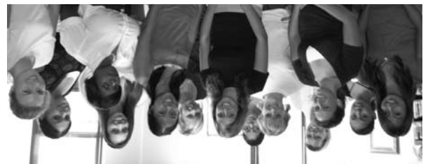
Some of our incoming freshman gather during Orientation prior to their Athletic Center tour.