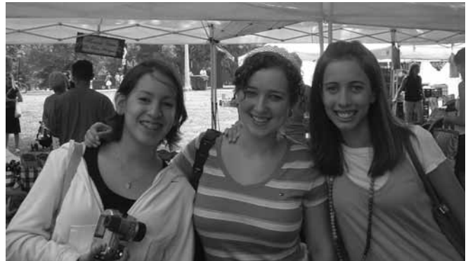
Three participants enjoying a tour of the organic market.

Lexington faculty served as instructors for the program that included seminars on management and service, hands-on experience in the culinary labs and on event planning. Included in the week-long program were tours of Chicago's Green City Market, The Intercontinental Hotel and The Chicago Cultural Center. On the last day of the program, the students prepared a luncheon event and hosted their families.