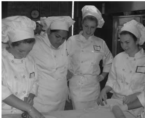
Campers practice dough making techniques.

Last June Lexington hosted a week long summer program for high school students considering educational opportunities in hospitality. Girls from California, Florida, New York, Texas, and Wisconsin joined Chicago high-school students for an exciting program of classes about service excellence, culinary arts, and event planning. The camp was filled to capacity and received rave reviews from attendees. One student even sent in her college application to Lexington the week after her Lexington experience!