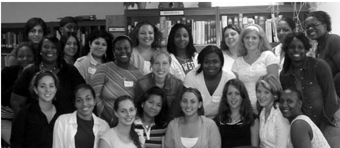
Some of Lexington's new students eagerly pose for a group photo during student orientation at the College.